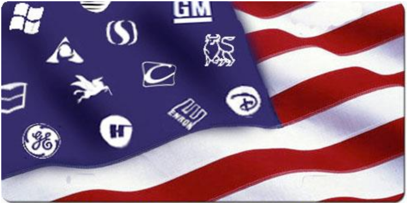
UNITED CORPORATIONS OF AMERICA