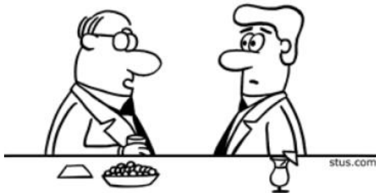
This “fiduciary” thingy really complicates pillaging a corporation.

"A corporation is a creature of the state. It is presumed to be incorporated for the benefit of the public. It receives certain special privileges and franchises and holds them subject to the laws of the state and the limitation of its charter. " (Hale v. Henkle).