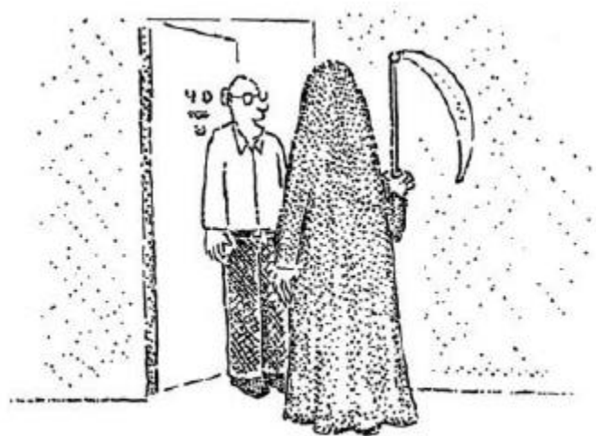
"What a relief! I thought you were someone from the IRS."

1 40. In 1954 Lyndon Baines Johnson , a 2 cabalist Jew and a political 3 scumbag, was sick and tired of 4 Texas Baptists preaching against his 5 liberal politics. Johnson declared 6 war on the church and devised a 7 clever scheme to silence 8 Ambassadors of Christ who opposed 9 his schemes. LBJ's great society did 10 not include the Ten Commandments 11 or a church on Main Street. He 12 proposed to Congress that in 13 exchange for "tax-exempt status" the 14 church would have to agree to keep 15 silent on political matters which the 16 government considered offensive. 17 Organizations placed in the I.R.C. 18 §501(c)(3) category must not 19 "participate in or intervene in, including the publishing or distributing of statements, any political 20 campaign on behalf of or in opposition to any candidate for public office".