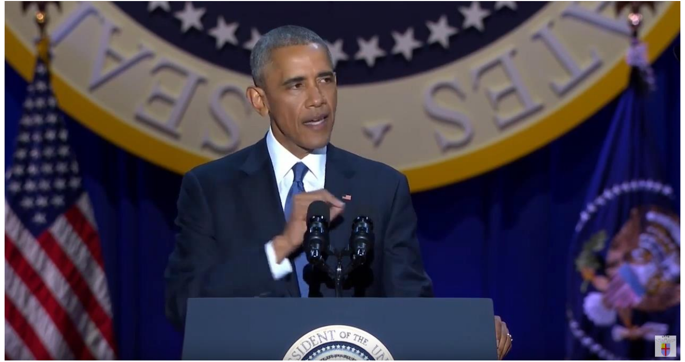
President Obama Admits in His Farewell Address that "Citizen" is a Public Office, Exhibit #01.018 YOUTUBE: <a href="https://youtu.be/XjVyEZU0mlc">https://youtu.be/XjVyEZU0mlc</a> SEDM Exhibits Page: <a href="http://sedm.org/Exhibits/ExhibitIndex.htm">https://sedm.org/Exhibits/ExhibitIndex.htm</a>

The above "public office" is the ONLY lawful subject of CIVIL legislation or CIVIL enforcement and filling it is VOLUNTARY. If it ISN'T voluntary, then you are a SLAVE and the Thirteenth Amendment prohibition against involuntary servitude is violated! To "unvolunteer" one simply removes themselves from a <u>domicile</u> on federal territory and thereby becomes a <u>STATUTORY "non-resident non-person"</u> in relation to the national government. The ONLY type of "citizen" he could possibly be talking about in the above video is STATUTORY citizens, not CONSTITUTIONAL/state citizens. For more details on the distinction between CONSTITUTIONAL and STATUTORY citizens, see: